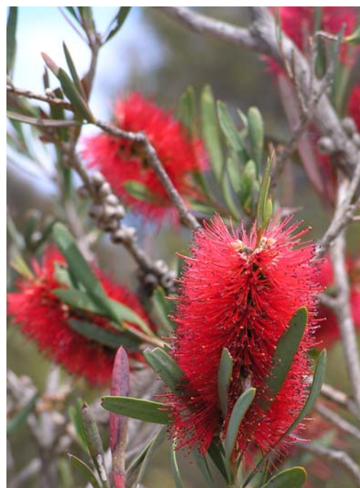
The Fiery Bottlebrush Callistemon phoeniceus : a local native with a reputation for salt tolerance. It can be seen growing tenaciously on granite rocks in the Bremer River.