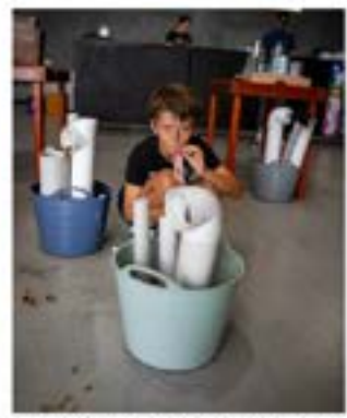
Event Hosted by Hopetoun CRC a member of the Fitzgerald Biosphere Community Collective and supported by: